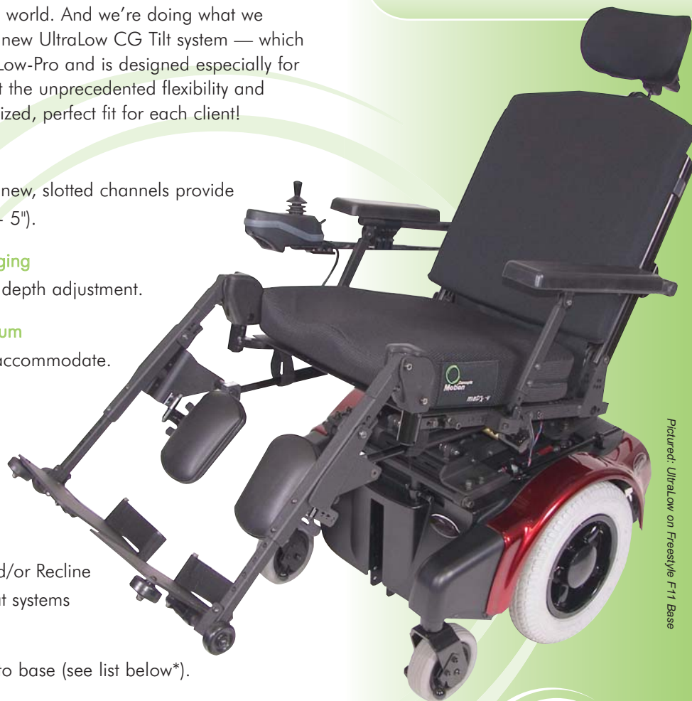
Pictured: UltraLow on Freestyle F11 Base