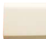
SACRAL/ LUMBAR SUPPORT