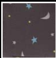
Kid*ab*ra fabric optional