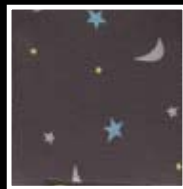
Kid*ab*ra fabric optional