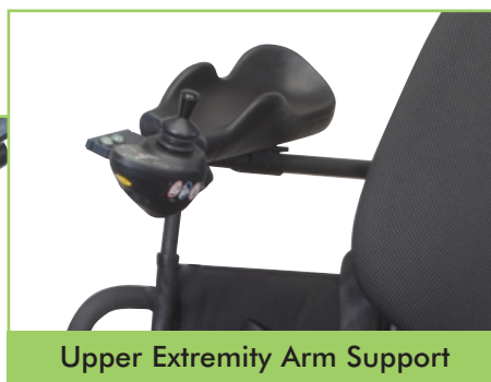
Upper Extremity Arm Support